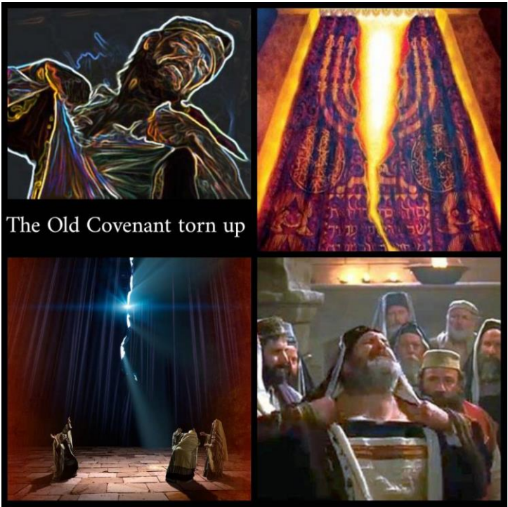
The Old Covenant torn up

The Messiah is the promised King and the Great Prophet, but His central function is as the Great High Priest (Zech.6.11-3). Clothed in modesty and royal humility, He alone stands between us & a well-deserved Hell.